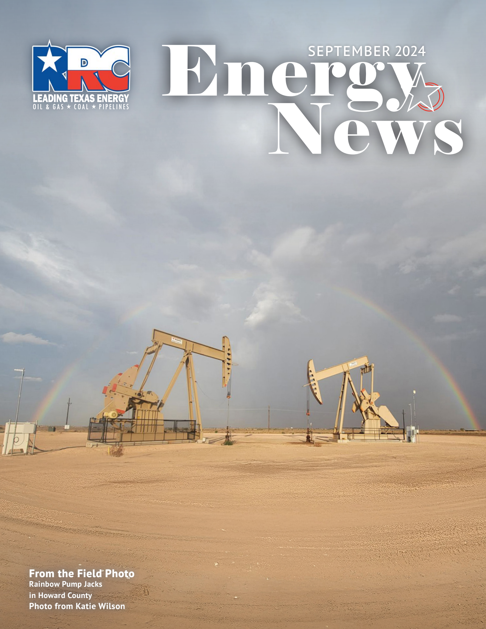
From the Field Photo Rainbow Pump Jacks in Howard County